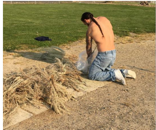
(An AIC preparing sweetgrass)

The SRCI chaplain's office has also distributed written material provided by Native American volunteers as well as video-based programming to broadcast on AIC televisions. SRCI religious services is working to implement virtual services that can be led by an offsite volunteer.