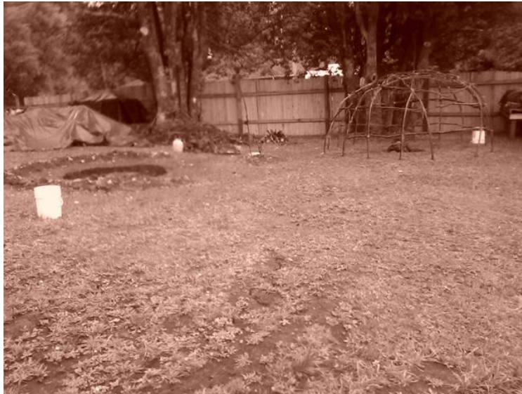
(Community based sweat lodge for aftercare)

A weekly meeting is held using the Wellbriety curriculum to assist with continuity of care for AICs releasing to supervision in the area. Three volunteers attended a 40-hour certified recovery coach training. The volunteers also network with Wellbriety groups across the state and with tribes in the area.