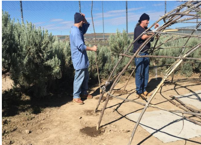
(AICs constructing the new sweat lodge)

Providing for the men's spirituality during pandemic restrictions required developing modified ways to conduct activities in a healthy way. Plans were submitted to conduct healthy and safe bereavement pipe ceremonies, complex-specific talking circles, and pipe ceremonies.